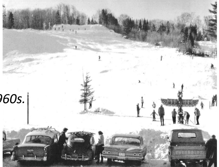
Three views of Mont Bellevue in the 1960s.